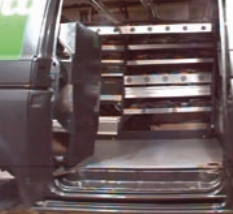
Examining the evidence.